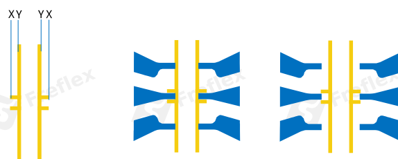
Figure 1: Alignment marks